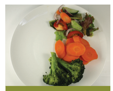
Fill half your plate with vegetables/salad